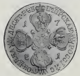
Lot No. 3343